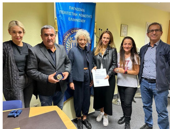
05.10.2023 AUTH's gratitude to GCCH