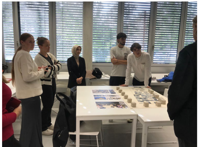
06.10.2023 KUP 4 at HFT Stuttgart