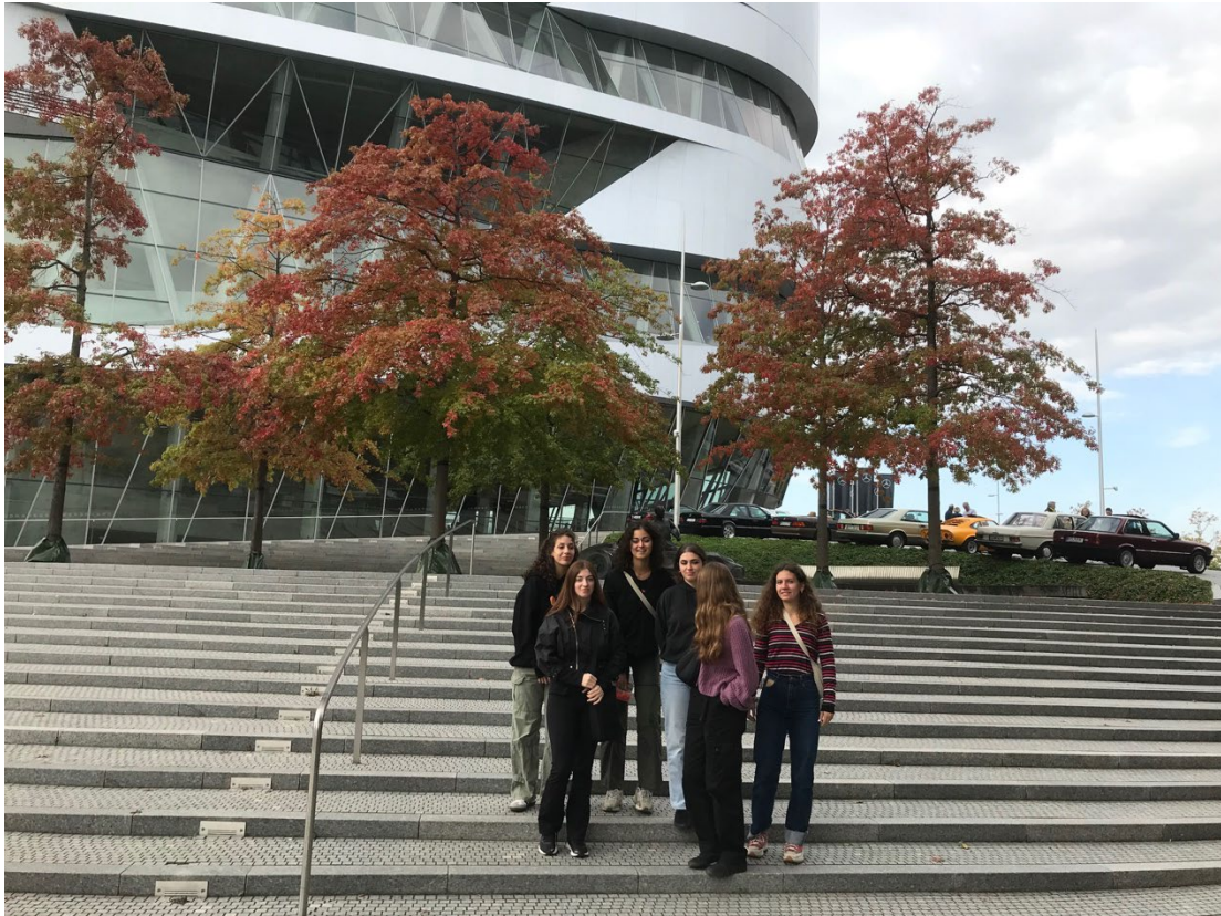
08.10.2023 KUP 4 Visit at Mercedes-Benz Museum