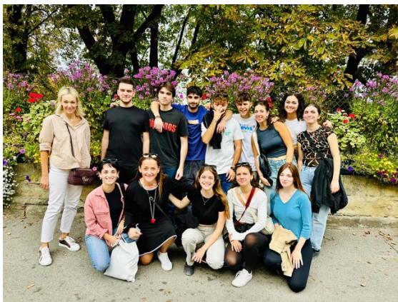
03.10.2023 KUP 4 welcoming of students by GCCH