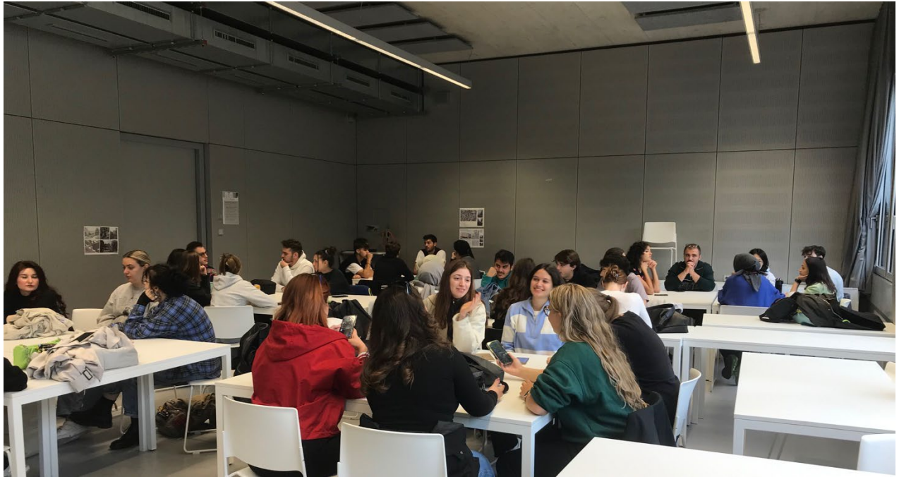
04.10.2023 KUP 4 Students working in international groups at HFT Stuttgart